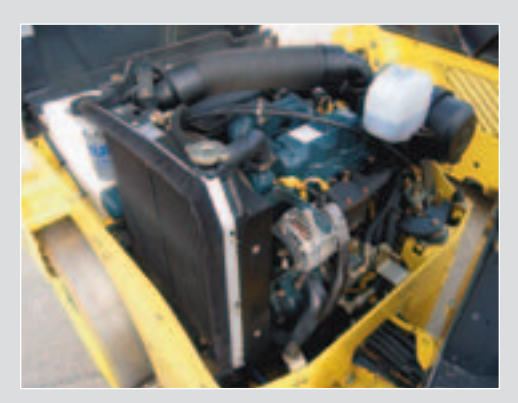
Easy access to engine and drive components for simplified servicing