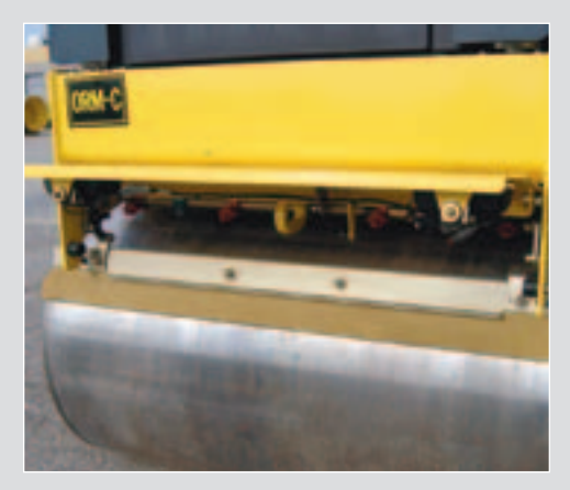
Wind protected, quick-disconnect spray nozzles with dual scrapers per drum.