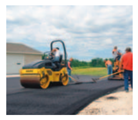
BW120AD-4 shown with optional folding ROPS.