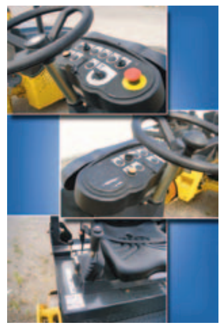
Ergonomically engineered operator's platform providing optimum comfort and maximum productivity.